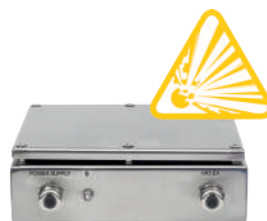
PM01.EX-1 intended for operation in hazardous area