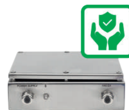
PM01.EX-2 intended for operation outside hazardous area